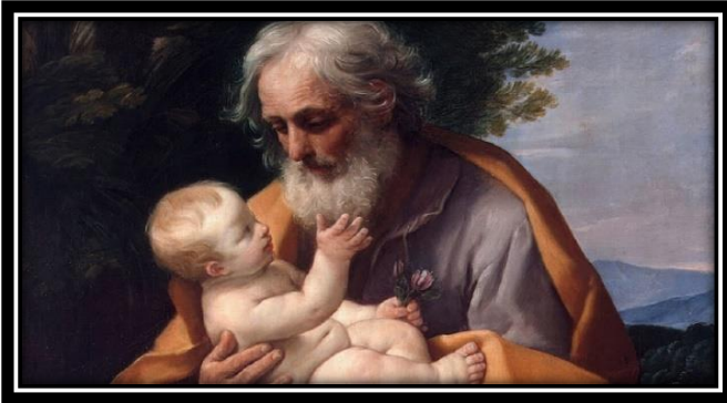
Year of Saint Joseph ... December 8, 2020, to December 8, 2021