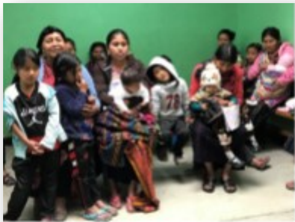
Patients waiting at medical clinic.